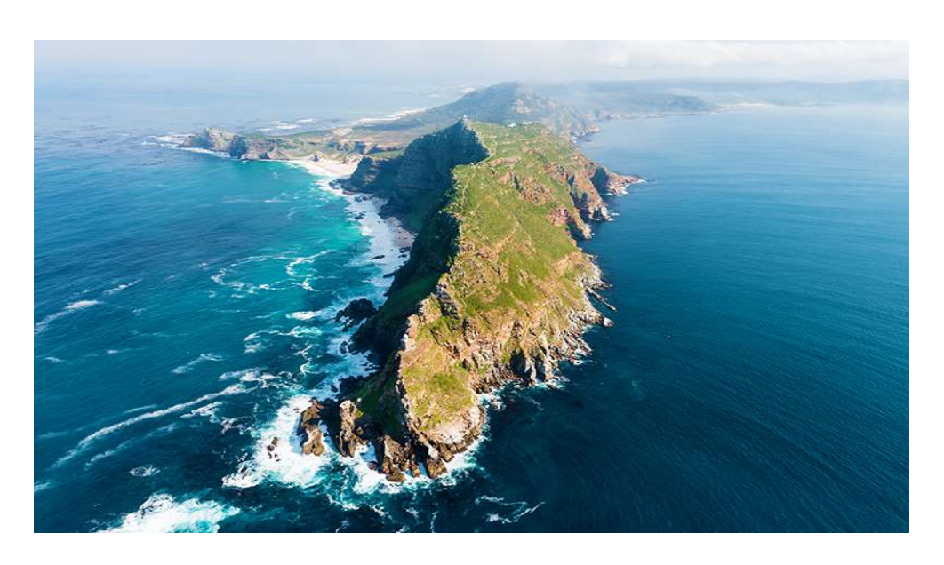
END OF GUIDED TOUR

NB: Customer has the option to enjoy part of his trip in the Cape Peninsula in ebike (not included in our rates)